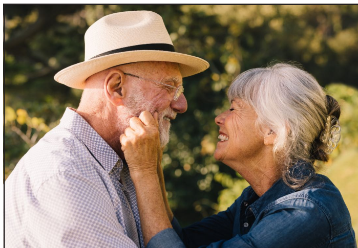
The blessing of God in the home . . . is as the sunshine of heaven. (Ellen White, The Adventist Home , p. 102.1

In every family where Christ abides, a tender interest and love will be manifested for one another; not a spasmodic love expressed only in fond caresses, but a love that is deep and abiding. (Ellen White, The Adventist Home , p. 94.1-4)