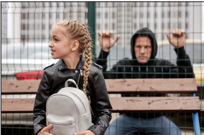
Discipline, like fences, help children to feel safe.

Lest someone get the idea that Solomon used the term “rod” figuratively, without intending to leave the impres-