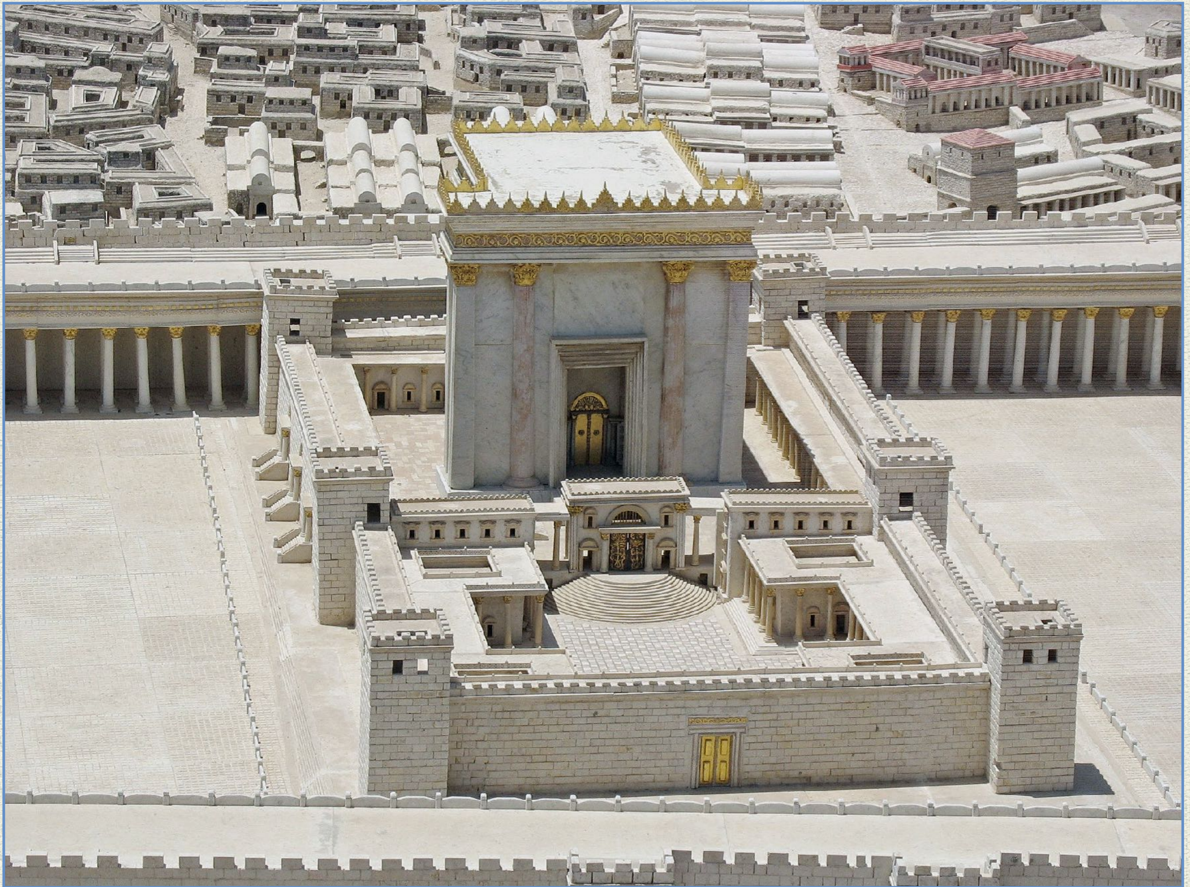
Model Herod's Israel Museum