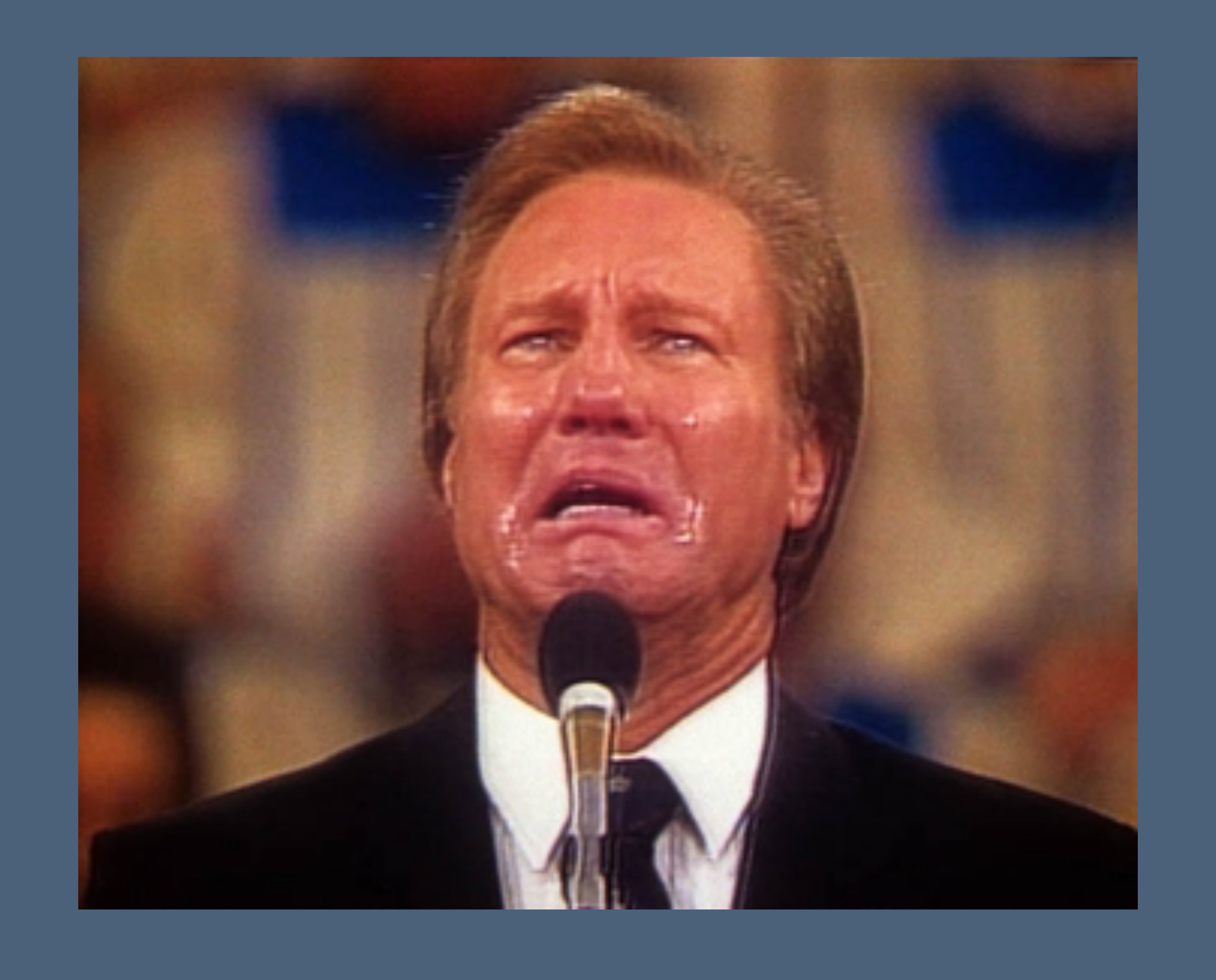
"I have sinned"