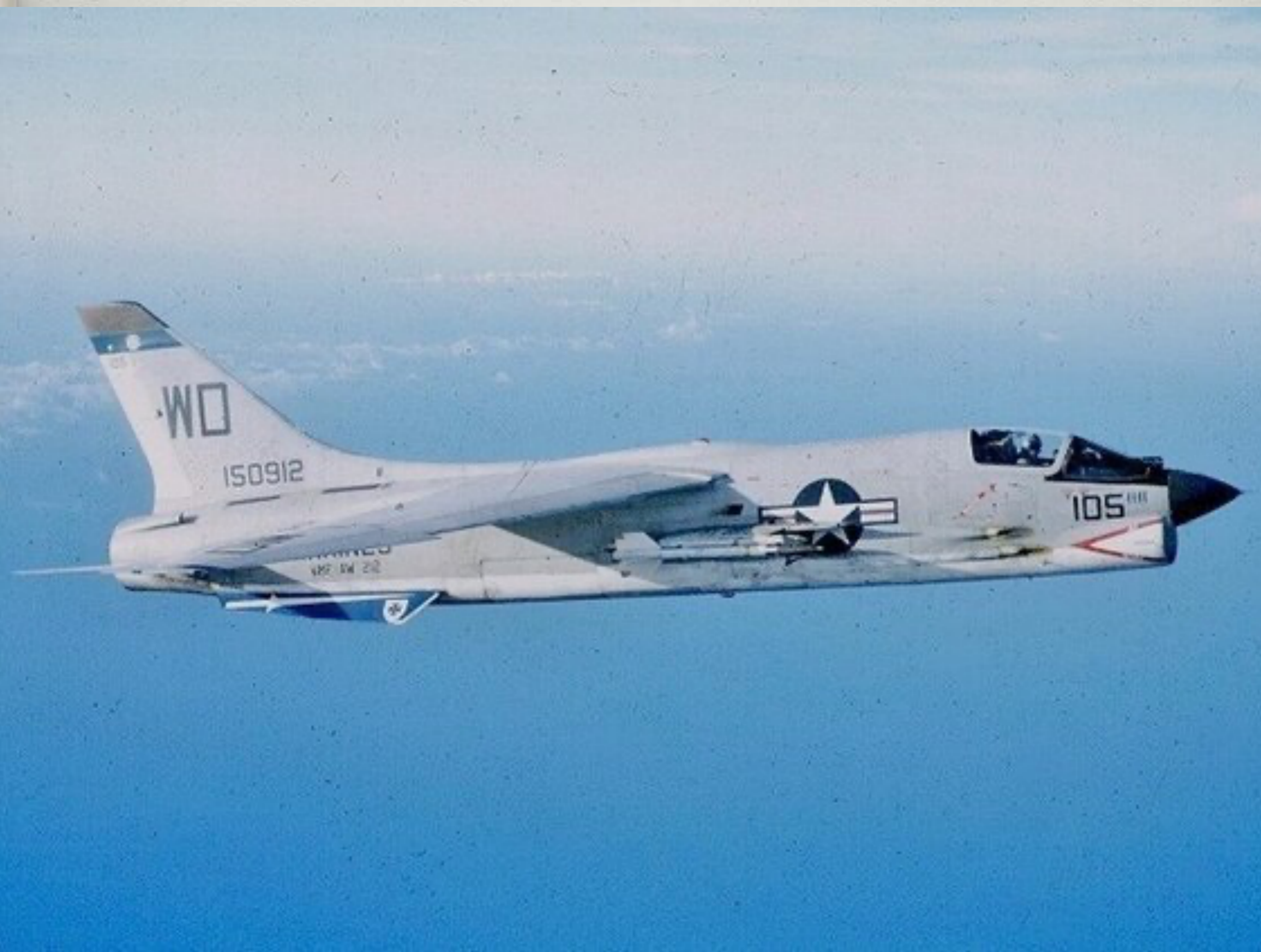
F-8 (F8U) Crusader