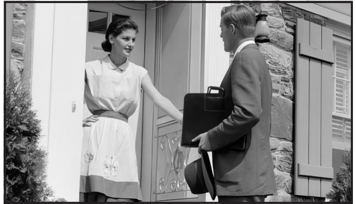
Colporteurs work on the front lines each day.

The Bible was delivered, and some time later the colporteur returned to inquire how she was getting on in the study of the Bible. He found her greatly interested, and eager to ask questions about many things which she did not understand. She also brought forth a book, saying, “Here is a book which I would like to have you look at and tell me if it is all right to read. It seems to be like a Bible, and it tells about the true Sabbath.” The book proved to be an old edition of “Bible Readings,” which a neighbor had found in a trash heap and had given to this truth-seeking