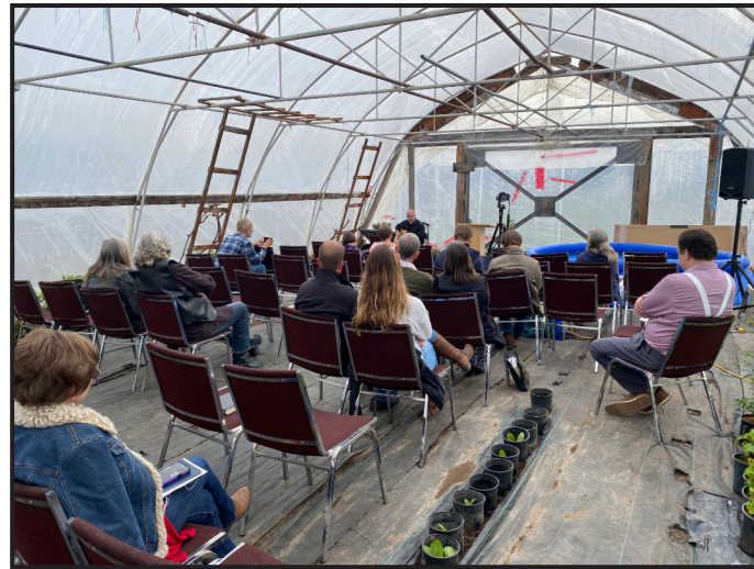
Sabbath meeting in the greenhouse

There was a sweet camp meeting near Kitwanga, British Columbia, Canada, April 27–30. You might be asking where is Kitwanga? Kitwanga is a small community in the west central area of British Columbia, but though Kitwanga is a small community, there are some believers there with very big hearts.