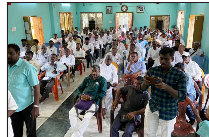
Ministers came to hear the word of God.

India is a contrast of knowledge and ignorance. Many of the people are very intelligent and well-schooled and yet the great majority live in ignorance concerning common hygiene and especially concerning the one true God. Sadly India is a very dirty country. There seemed to be trash everywhere you looked or stepped. Open defecation takes