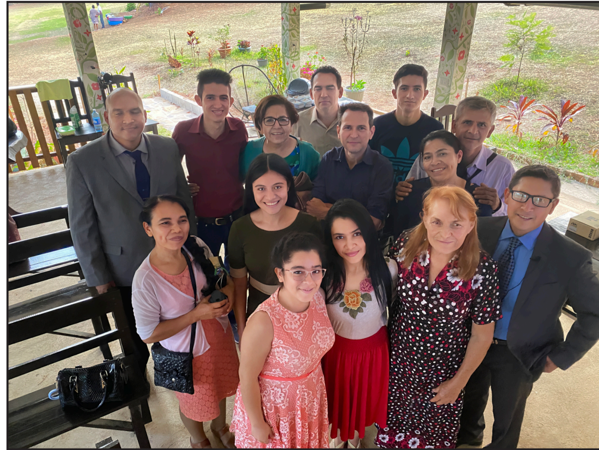
Some of the group at the camp near Perquin