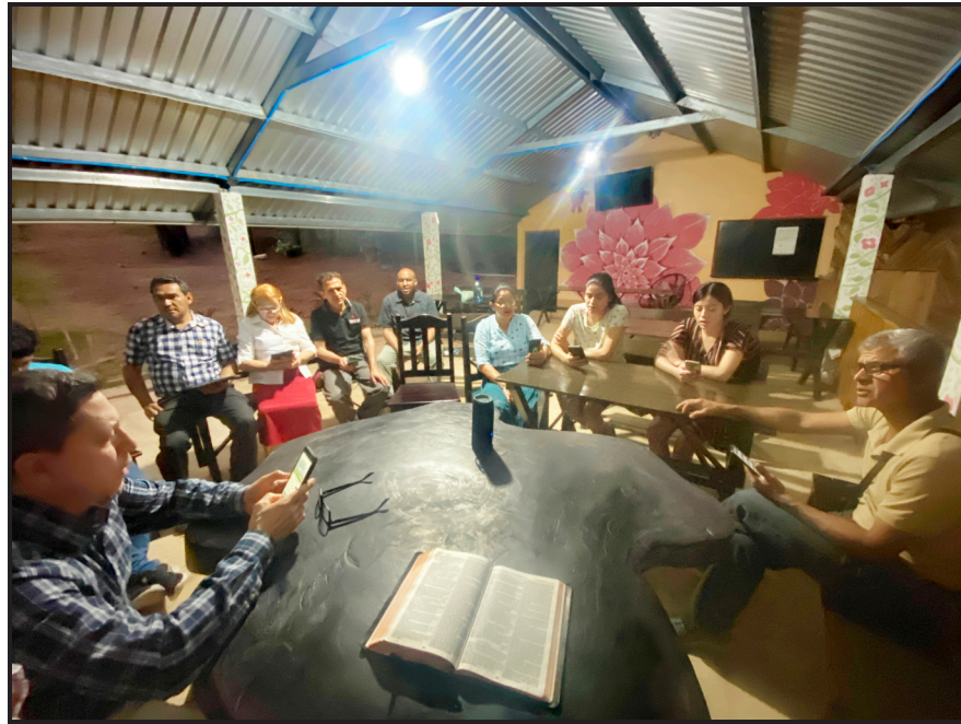
Evening meeting at the camp near Perquin