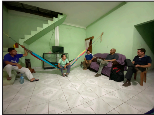
A home meeting in Santa Rosa De Lima