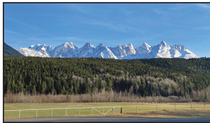
Seven Sisters Mountains

There is a pullout the government has built on the road adjacent to their property where people stop to get a nice view of the mountains. The Goodwill's have an organic