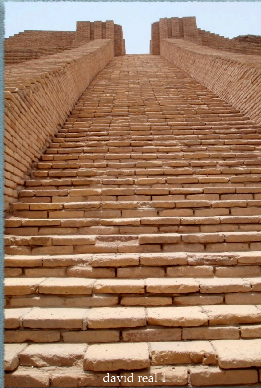
david real 1