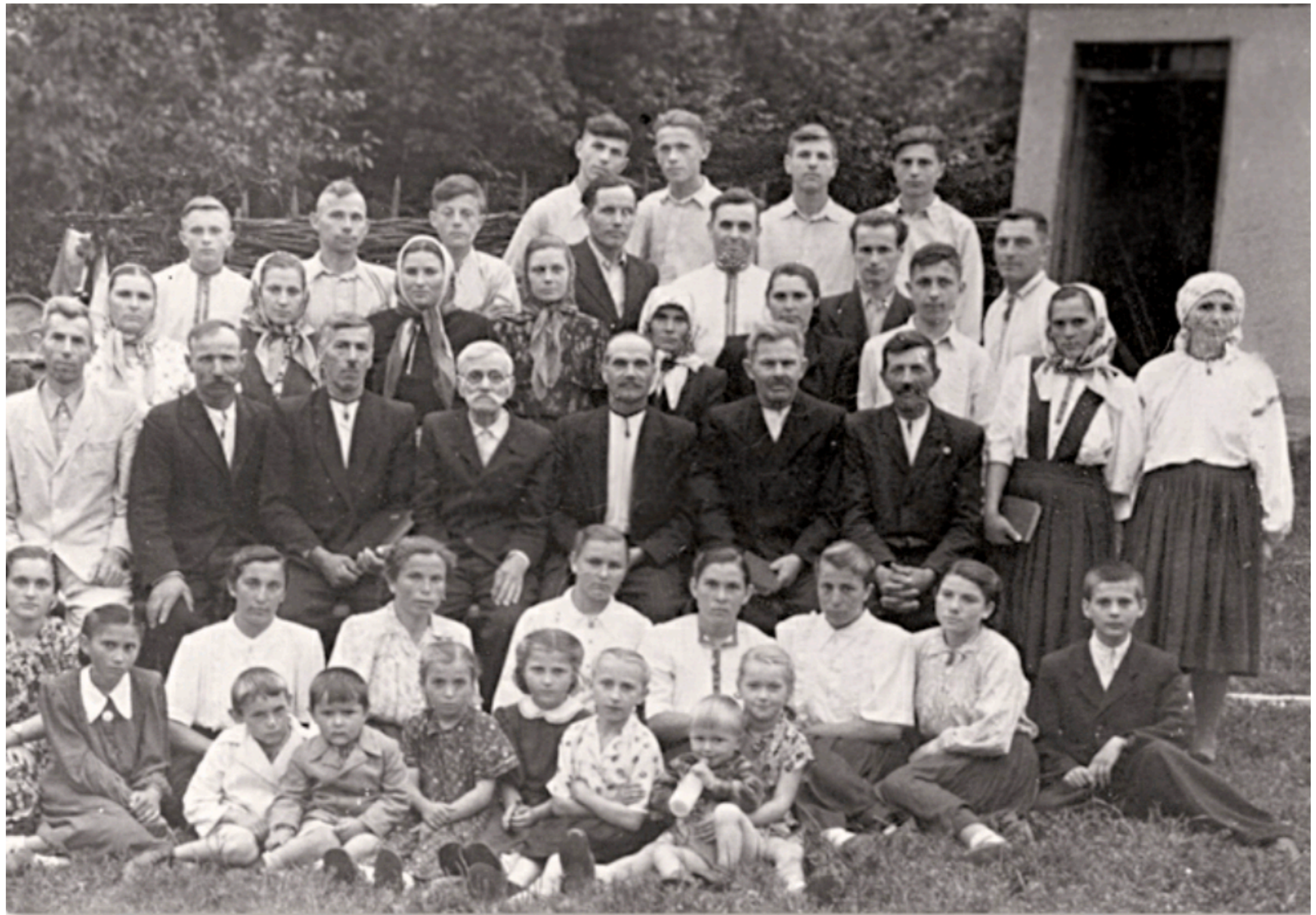
Kolomeya church members. 1947.