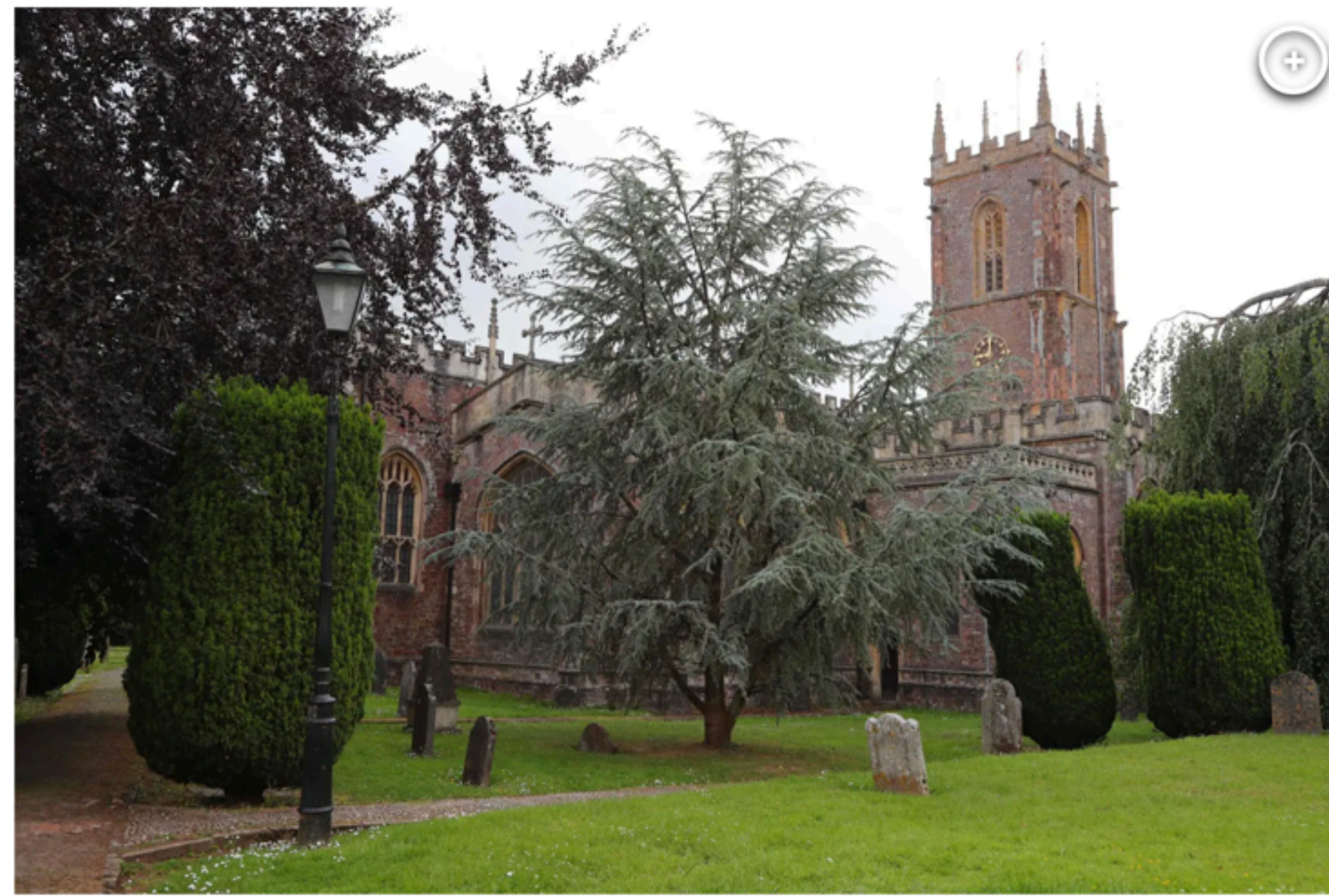
The church's comments sparked widespread criticism