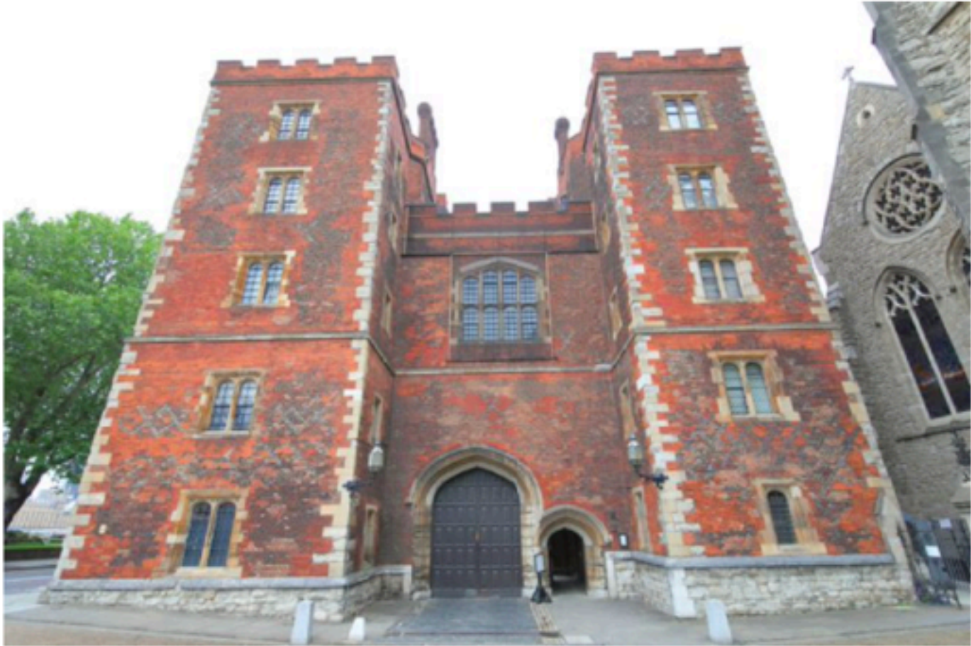
Lambeth Palace, London, residence of the Archbishop of Canterbury.