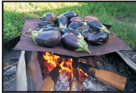
Roasting eggplant in Bralia

On the following day, the pastor was there as promised and listened to our presentations on the godhead without saying a word. The people, however,