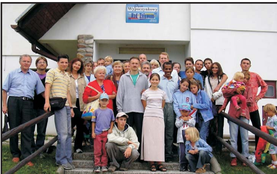
Polish brothers and sisters who attended the camp meeting.

During our last day in Poland, a brother arrived adorned with a shaggy beard reaching almost to his waist. That night as I responded to the question concerning women covering their heads, he stood to his feet and told me that I was not qualified to be a teacher of the Word of God and that I was teaching falsehood. At first I was angry and inclined to answer him with hot words, but I waited a while before responding and my answer was simply to tell him that I had met many Pharisees like him and I quoted Paul’s words to him that in