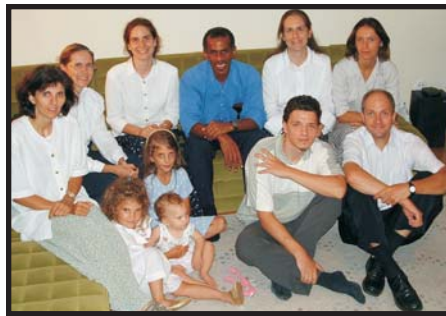
Relaxing after the Sabbath meetings in Keszthely