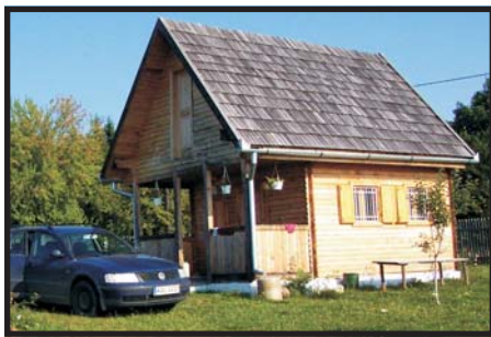
Cabin in Sfintu Gheorghe

The people at Brashov were almost uniform dressed, mostly in black and white. All the men were clean-shaven and dressed in similar suits. A well-trained choir rendered several beautiful musical selections. However,