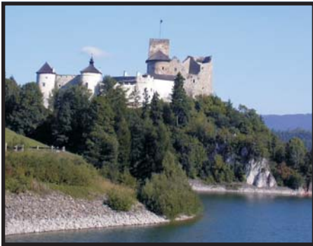
The Zamek (castle)