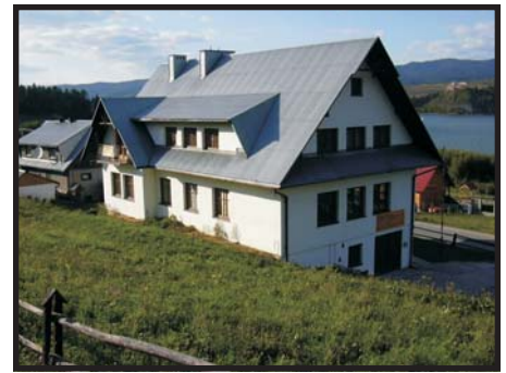
#73 Niedzica Zamek