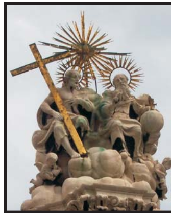
Trinity statue at Trinity Way in Budapest

Nevertheless, we enjoyed these visits and our study with Brother A___ was especially delightful. We found him to be a cheerful old man who was eager to share his experiences of what he had suffered for the faith. He told of how he had spent four years in prison for refusing to work on the Sabbath back in the 1950s when Hungary was still communist. He had been drafted into the army and was allowed to work as a non-combatant. For a year he was allowed to have Sabbaths off, but later hardliners took over the government and he was told that, from henceforth, he had to work on Sabbaths. When he refused, he was cast into jail to await trial. Every morning, for about a month, until the trial, they would come to his cell, point at him and say, "Sabbath, you come." Then they would take him out and give