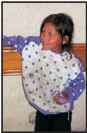
Gypsy girl begging