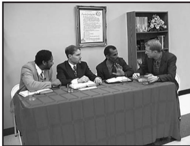
Panel Members from “Answers to Objections”

The above study, “Answers to Objections,” is an edited portion of the latest production from the series, “The Good News About God.” This study-tape is now available in NTSC and PAL video formats. There will be a version for Adventists (AV) and non-Adventists (NAV) as well. For video cassettes, request tape number GNAG-V-06. The suggested donation is $7.00 per tape plus actual postage. For audio cassettes, request GNAG-A-06. The suggested donation is $2.00 plus actual postage. Please specify which version (AV or NAV), when ordering. ✍