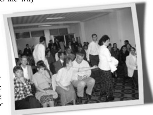
Meeting in Spain