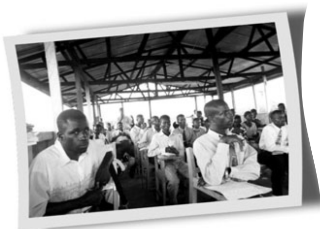
Meeting in Ghana

Take care. We will tell you more when we get home. ✍️