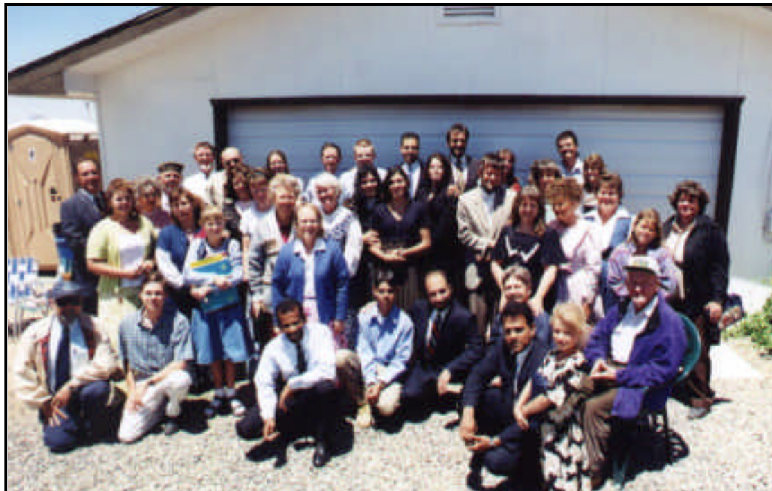
Sabbath Group Picture

One of the highlights of the camp meeting was the early morning testimonies given by the ministers and elders in attendance. These were some of the most en-