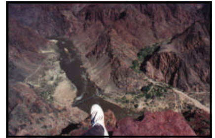
A spectacular view of The Colorado River in the Grand Canyon

All of the meetings were recorded on cassette tapes and are available from the church at Wilhoit. For a list of the tapes, and the cost, please write to Sister Arlene Bailey, HC 68 Box 743, Kirkland, AZ 86332.